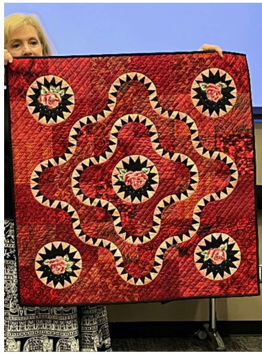
Gail B. Beaded Floral