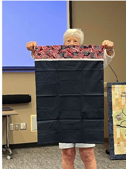
Lorna L. [redacted] Folds of Honor and Pillow cases for Quilt Storage