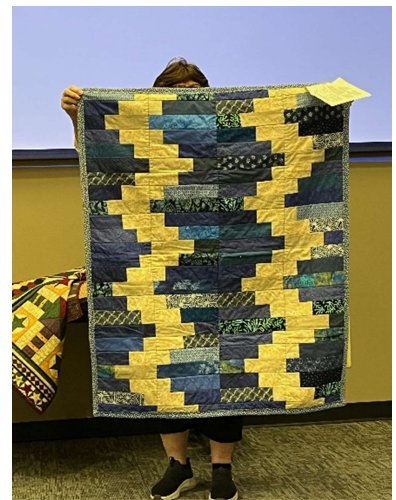
Donna A. Blue Scrap Quilt