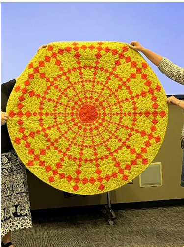
Gail B. Quilt in a Day