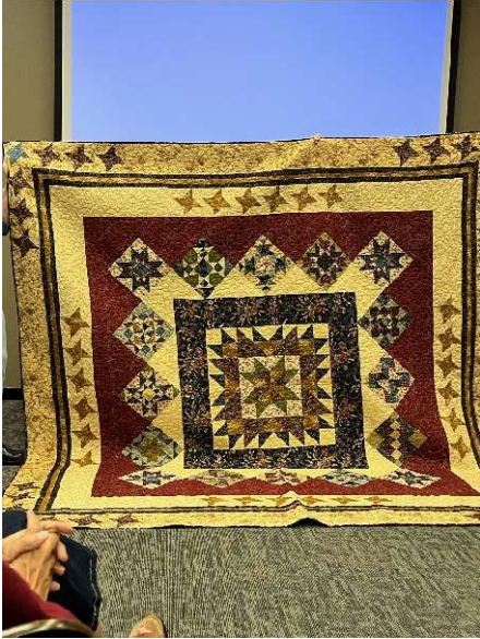
Tammy S [redacted]' First Ladies Quilt